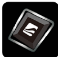
White – medium