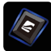
Blue – low