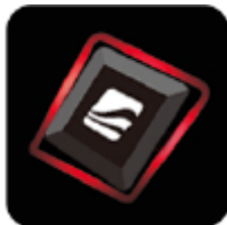
Red – high